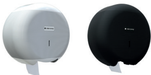
DSP WA TJ MAX REC W DSP WA TJ MAX REC K